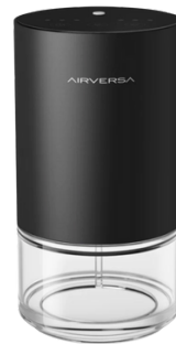
Product Name: Luxe Waterless Diffuser Price: $60-$70 Wholesale: $50-$60