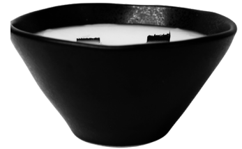
Product Name: 104 oz Luxe Candle Price: $200 Wholesale: $120