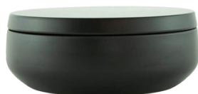
Product Name: 12 oz Luxury Candle Price: $30 Wholesale: $16.20