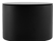
Product Name: 6 oz Luxury Candle Price: $18 Wholesale: $10.20

S I M P L E | M I N I M A L | M O D E R N