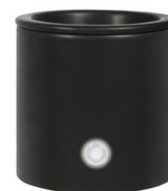
Product Name: Ceramic Wax Warmer Price: $22 Wholesale: $13