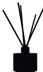
Product Name: 4 oz Luxury Reed Diffuser Price: $24 Wholesale: $12