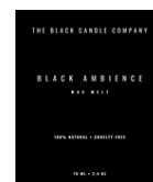
Product Name: 2.4 oz Luxury Wax Melts Price: $8 Wholesale: $4.20