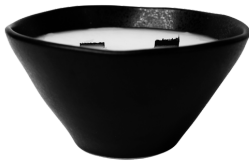
Product Name: 14 oz Luxe Candle Price: $50-$55 Wholesale: $32-$35